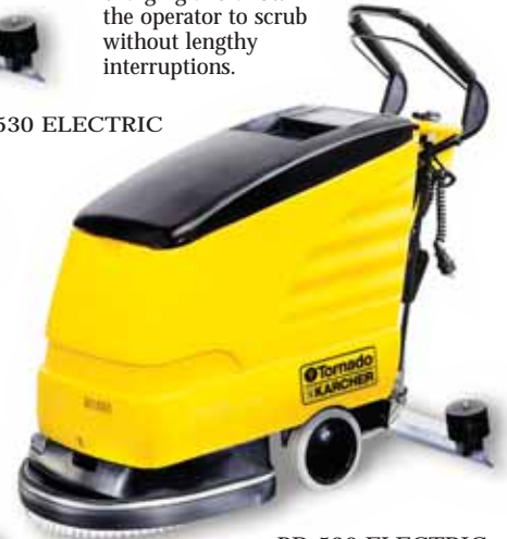
BD 530 ELECTRIC